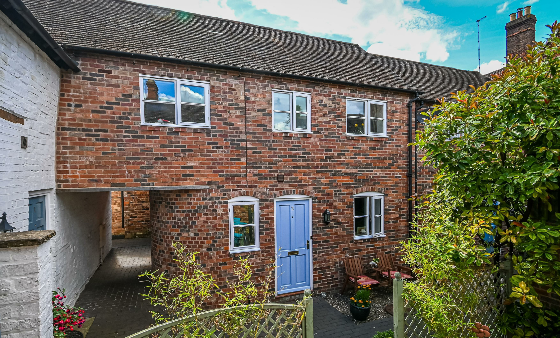
2 Old Bakery, Bank Street, Bridgnorth, Shropshire, WV16 4BP